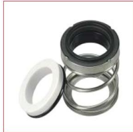
TIPO 143 Equivalente VAZEL linea A SEALOL tipo 43